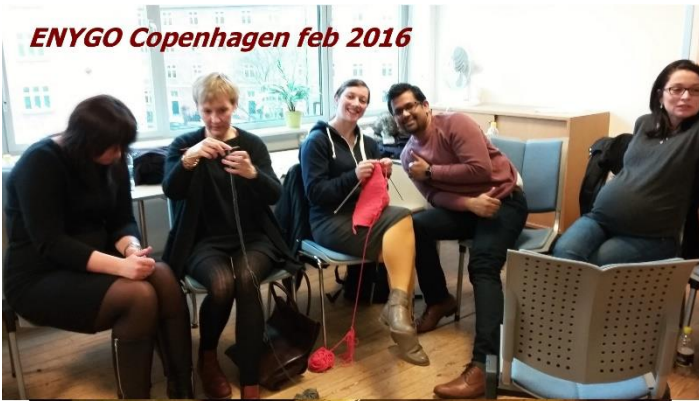
ENYGO Copenhagen feb 2016